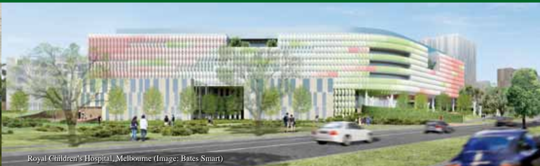
Royal Children's Hospital, Melbourne (Image: Bates Smart)