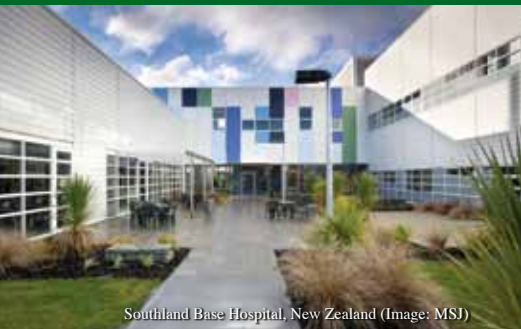
Southland Base Hospital, New Zealand

Register online today at www.designandhealth.com