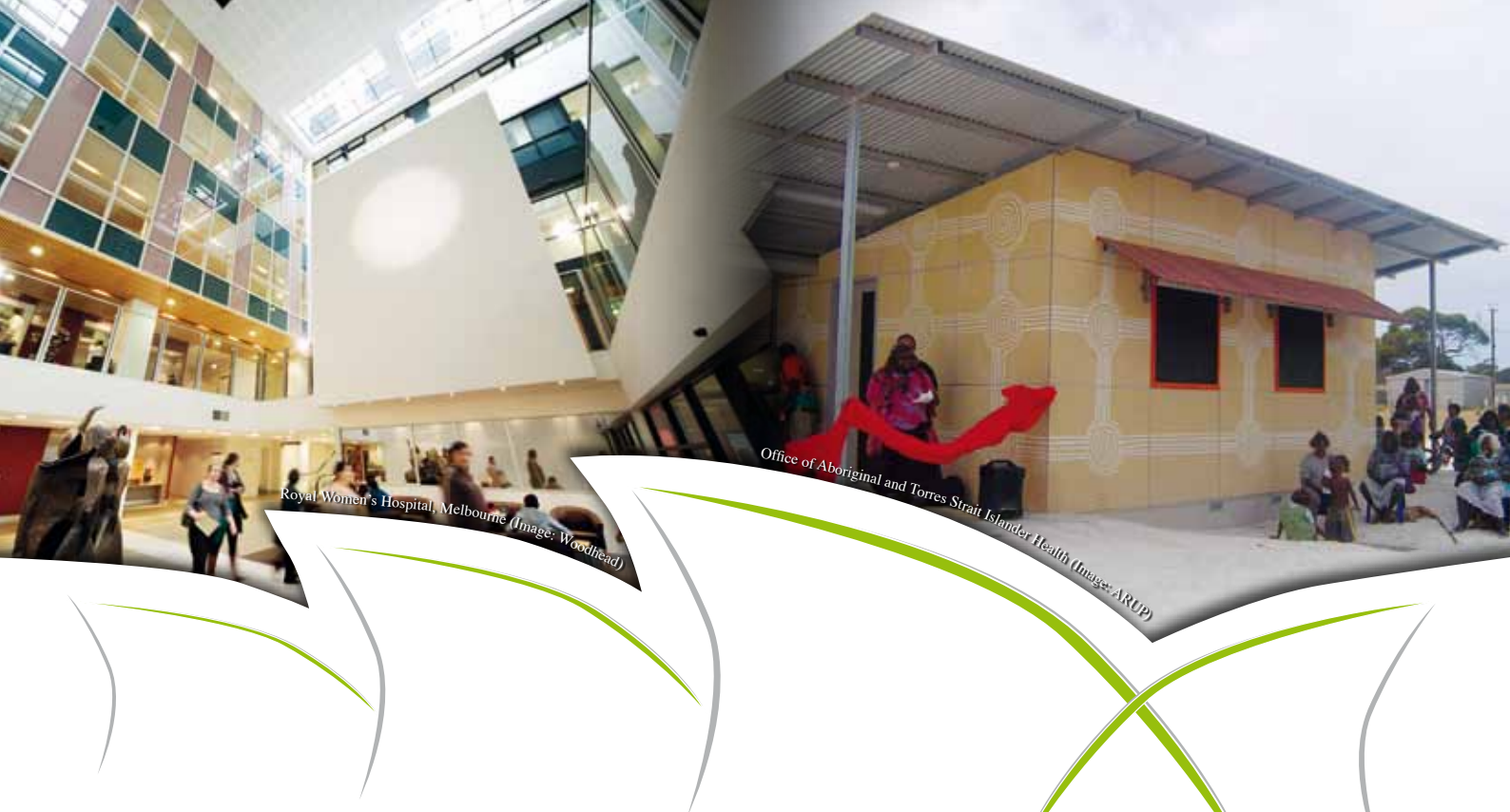
Royal Women's Hospital, Melbourne